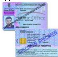
Specimen of an Application Registration Card (ARC)

Application Registration Card (ARC) – This shows that the person has made an application for asylum. An ARC is a credit card sized document issued to asylum applicants after screening to show that they have applied for asylum.